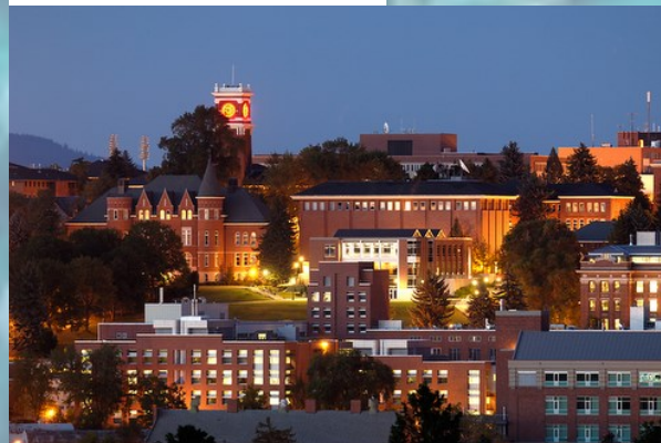
Central campus at twilight.

Microsoft, Amazon, and Blue Origin. Let us know if your organization or company is interested in coming to talk to us about the exciting work in materials you are doing.